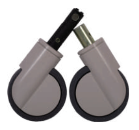
Plastic Body Castors 12.5 cms