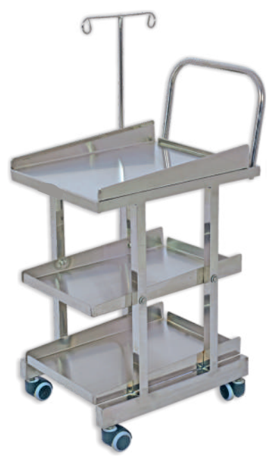
With S.S. frame work