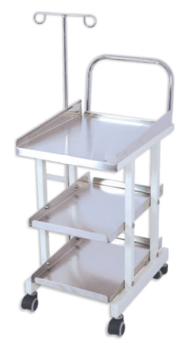
With EPC frame work

P.C. No.: 1287 With EPC frame work P.C. No.: 1287S With S.S. frame work