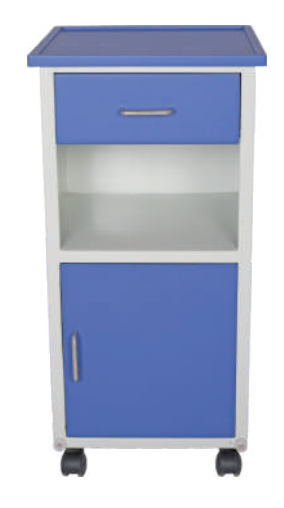
With Modified Membrane Top